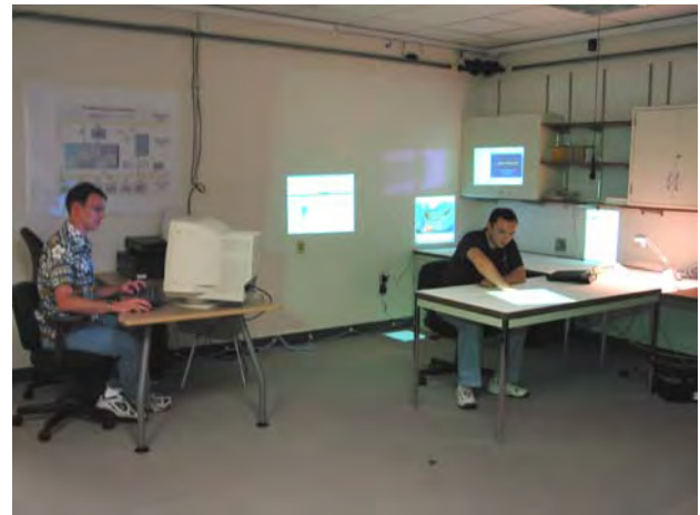
Figure 2. An overview of the experimental setup (prior to installing the “round table”). The “wizard” is seated at his control station on the left, and a researcher is playing the role of a participant on the right. Note the projected images on the wall, desk, and floor surfaces.

We performed the user study in one corner of a dedicated projection lab (see Figures 1 and 2). We placed several pieces of furniture in our simulated office space to resemble a typical individual office layout. The researcher guiding the participant through the study was seated at a video recording and system monitoring system across the desk from the participant. The “wizard” sat behind the participant as a monitor, which displayed multiple live camera views of the simulated office. (This perspective, together with the “wizard’s” knowledge of the participants’ intentions, enabled the “wizard” to evoke convincing feedback in response to their interactions. In debriefing, 5 of 9 participants reported that they believed the system was a fully-functional implementation.) Participants were led to believe that the “wizard’s” presence was necessary to provide